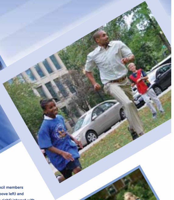
President's Council members Carl Edwards (above left) and Grant Hill (above right) interact with children at the Council Meeting Youth Session in Washington, D.C., in September 2010.