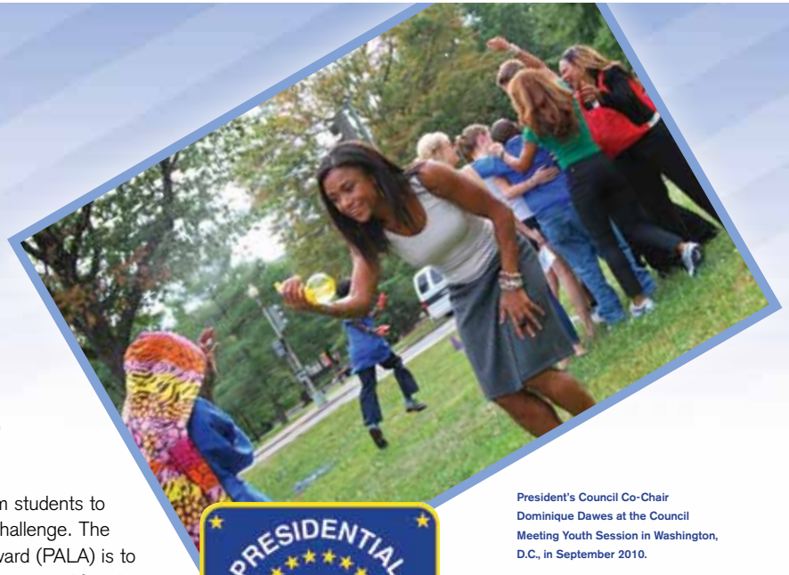
President's Council Co-Chair Dominique Dawes at the Council Meeting Youth Session in Washington, D.C., in September 2010.

Visit www.presidentschallenge.org to sign up for the Million PALA Challenge and find additional tools and resources to help you track participation and communicate with participants along the way.